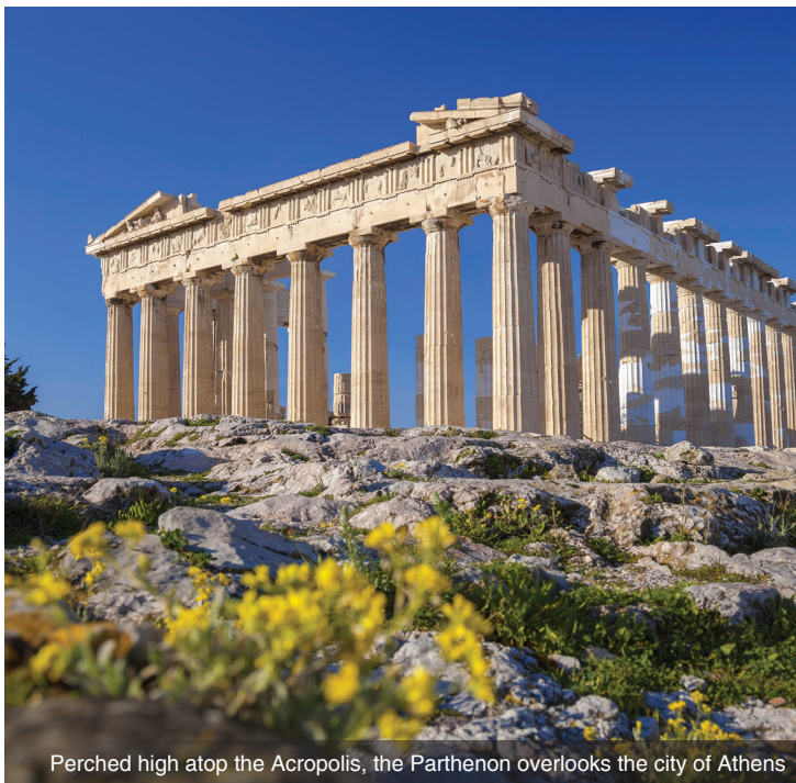
Perched high atop the Acropolis, the Parthenon overlooks the city of Athens