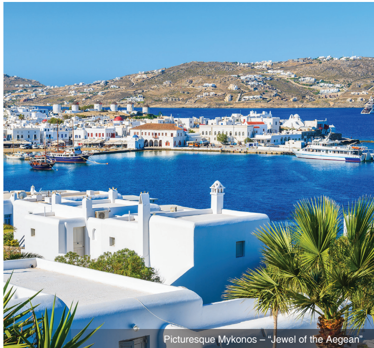
Picturesque Mykonos – “Jewel of the Aegean”

DAY 1 Depart the USA: Depart the USA on your overnight flight to Athens, Greece, a city with a history that dates back almost four millennia.