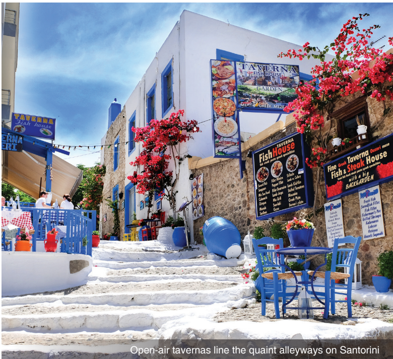
Open-air tavernas line the quaint alleyways on Santorini

remainder of the day at leisure. Browse in the boutiques, visit the beach or simply enjoy people-watching and meeting the locals at a sidewalk café. Meal: B